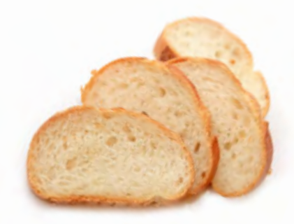
Would you like some bread with the soup?

Carrot coconut ginger cream soup with coriander pesto (vegan)